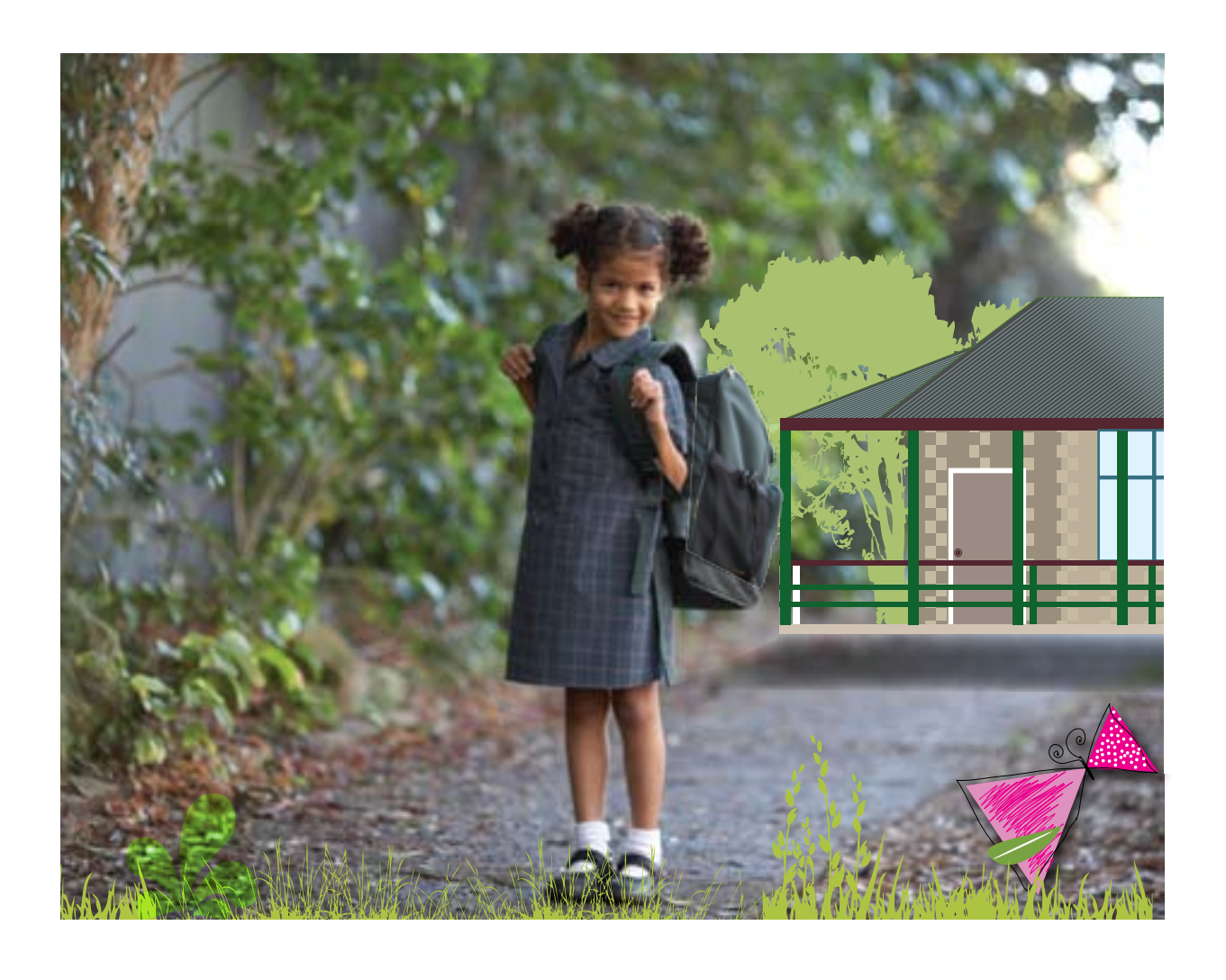
It's your school!